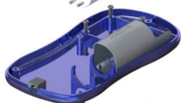
5 Base Assembly