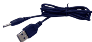
6 USB Adaptor