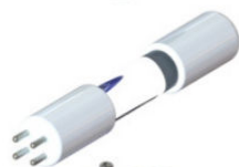
4 Photoplasma™ Lamp pre-installed