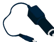
7 12V DC Adaptor