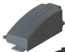
2 Power Supply