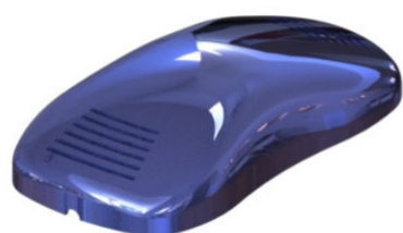
1 Cover Assembly